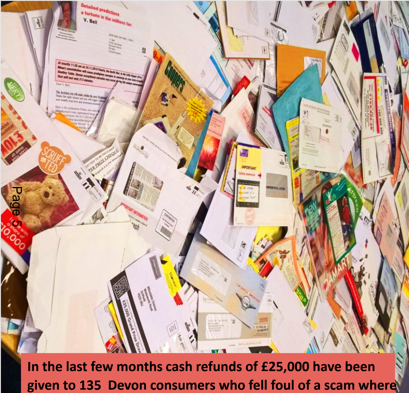
In the last few months cash refunds of £25,000 have been given to 135 Devon consumers who fell foul of a scam where money was sent to a mailing house in Kansas, USA